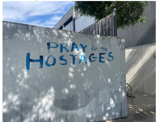
Encouraging graffiti near Wattle Park in Melbourne, a ‘little light’ in the midst of rising antisemitism in Australia.