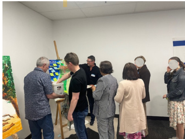
A poignant occasion as participants dip a finger in paint and place an imprint on a prayer map for Israel, painted by Robert Gerlach